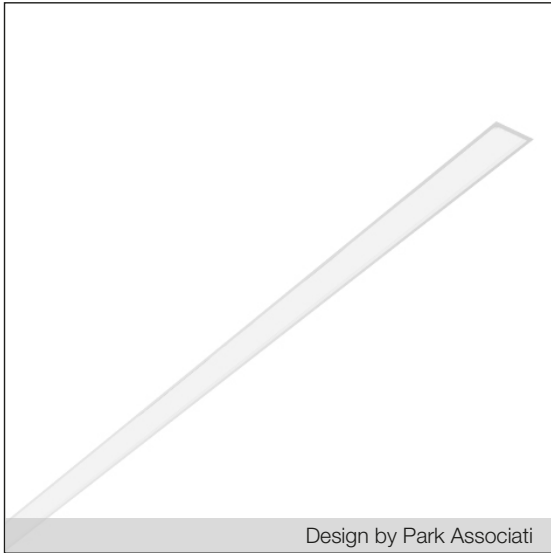
Design by Park Associati