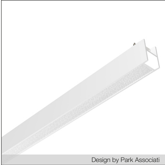
Design by Park Associati