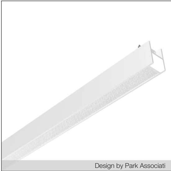
Design by Park Associati