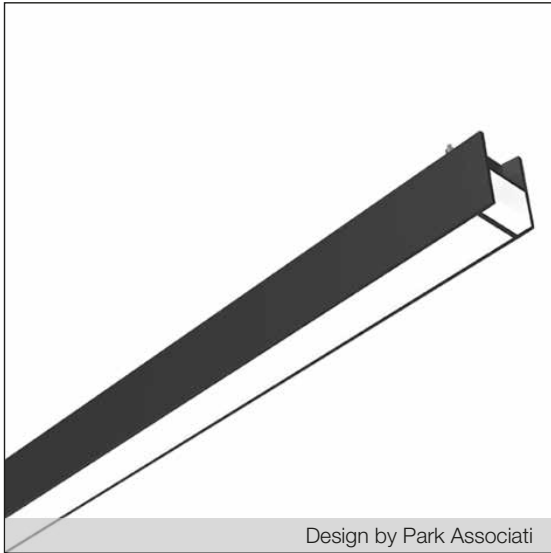
Design by Park Associati