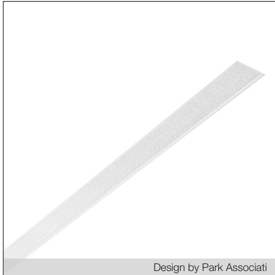
Design by Park Associati