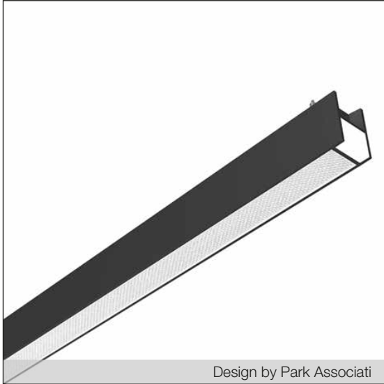
Design by Park Associati