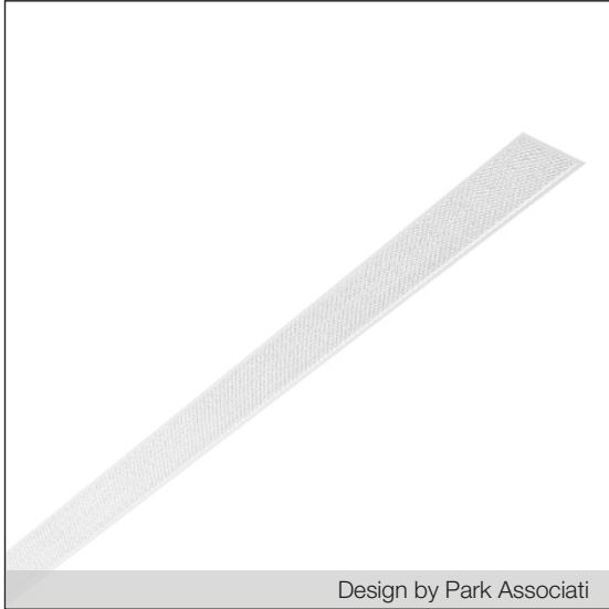
Design by Park Associati