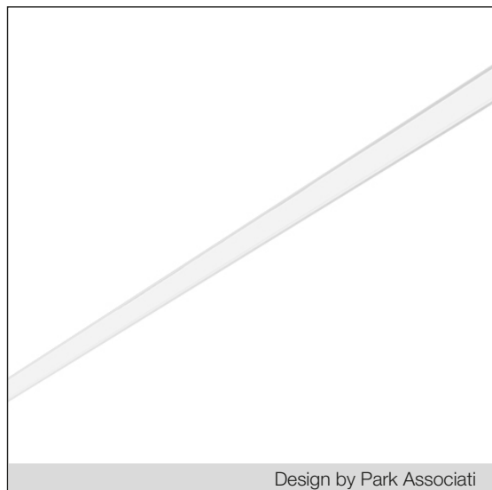
Design by Park Associati