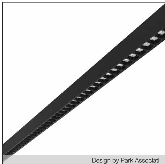
Design by Park Associati