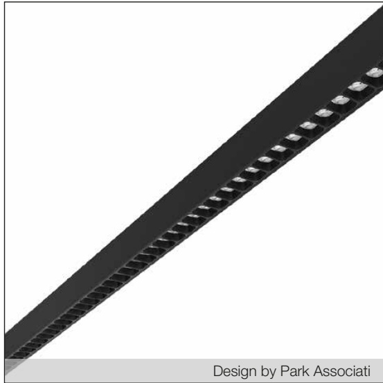
Design by Park Associati