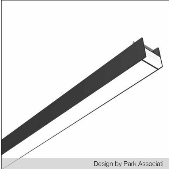
Design by Park Associati