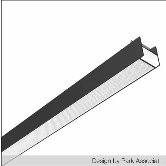
Design by Park Associati