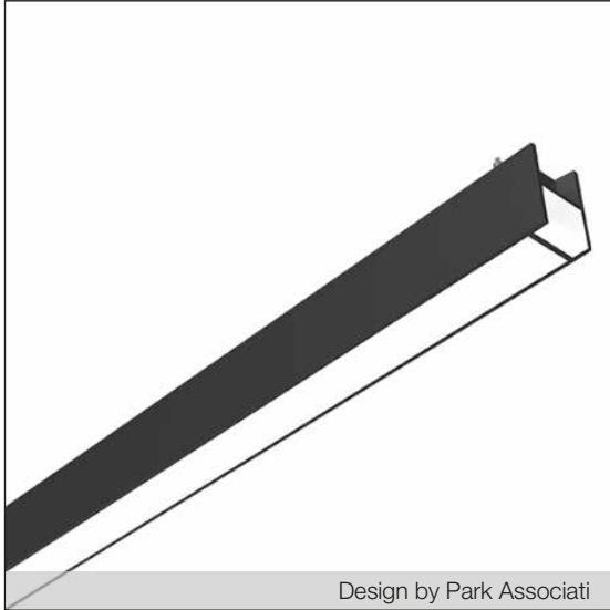
Design by Park Associati