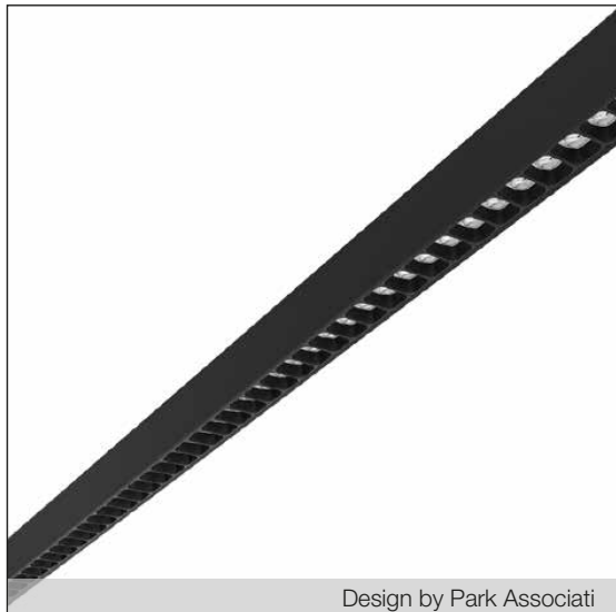
Design by Park Associati