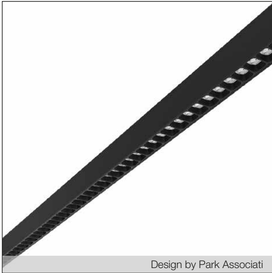
Design by Park Associati