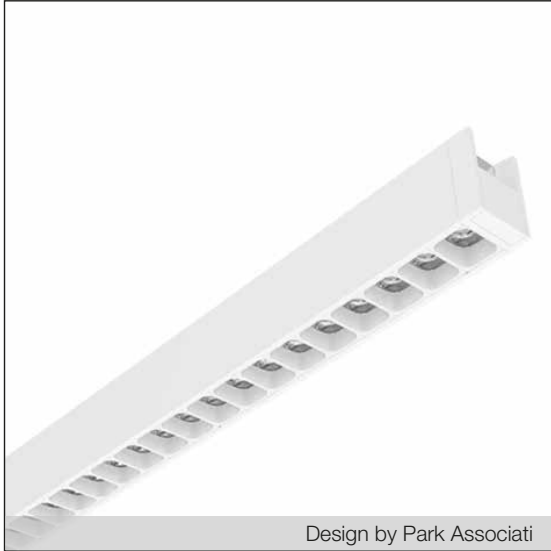
Design by Park Associati