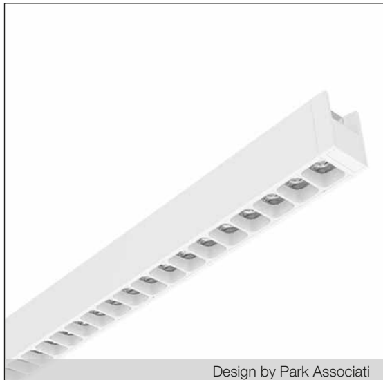
Design by Park Associati