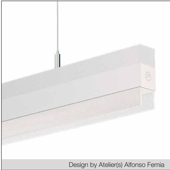
Design by Atelier(s) Alfonso Femia